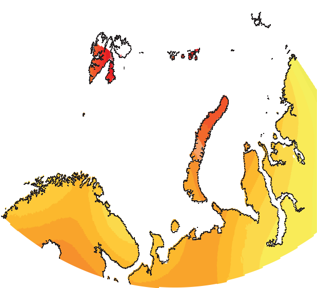
Change in temperature, °C